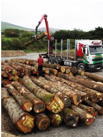
oak trees arriving at Felin Uchaf Sept 2012