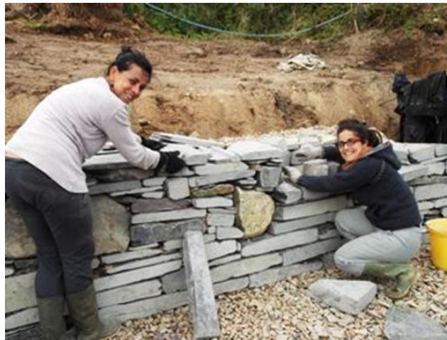
building stone walls